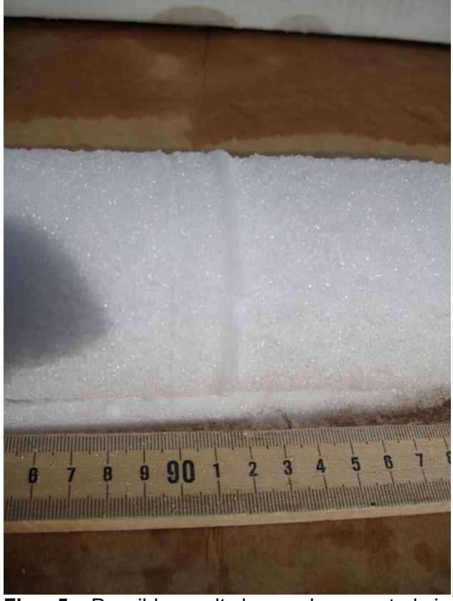
Fig. 5: Possible melt layer documented in shallow firn core.