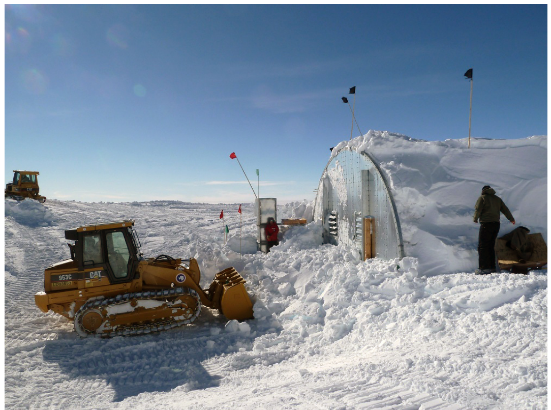
Digging out the doors to the drilling and core handling arch at the beginning of the field season.