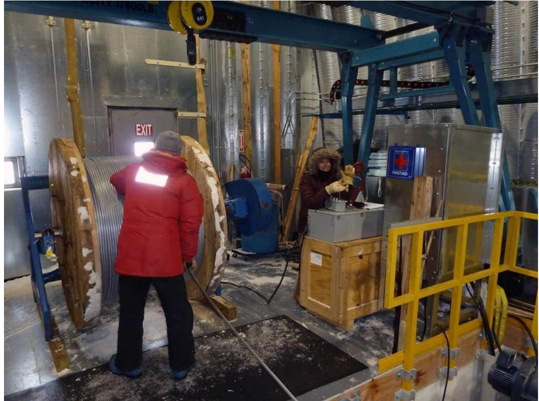
Unspooling of the old 3400-meter-long drill cable from the DISC Drill's winch drum.