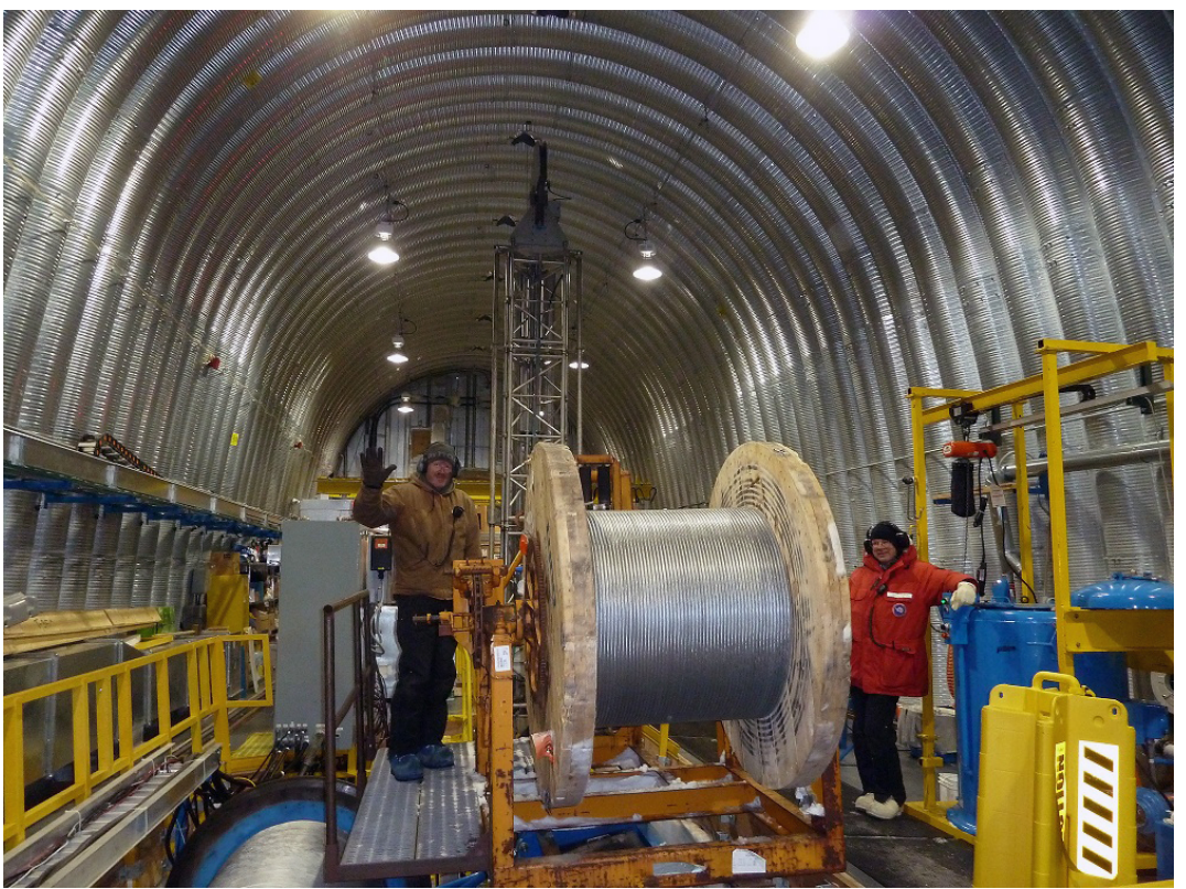
Spooling on the new 4200-meter-long drill cable.