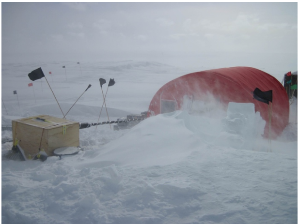
Fig. 1: Logging shelter located adjacent to the drilling arch. The logging cable exits the shelter, passes over a sheave wheel (inside a protective box), before dropping into the arch. With the shelter, logging operations were able to continue unimpeded through the poor weather that was prevalent during the 2011-12 field season.

<u>Season Note:</u> John Fegyveresi deployed on December 12th as a member of the I-477 ice-core science tech group. Work that was done related to I-168 was done as a second priority to this project and was accomplished during non-working hours and drill down-time.